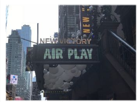
New Victory Theater, New York City, USA